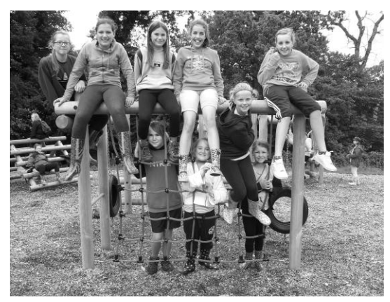
Having fun at "Guys and Dollies"

The Autumn Term was dedicated to "100 Years of Homemaking" Challenge Badge. We had great fun making corn dollies, cleaning the brasses at St Bartholomew's, Flower Arranging, Soap Making, Sweet Making and learning to sew our badges onto our uniforms. We also took part in "Vision" which was the Centenary finale with fireworks and renewal of our promise at 20:10 on 20/10 in 2010.