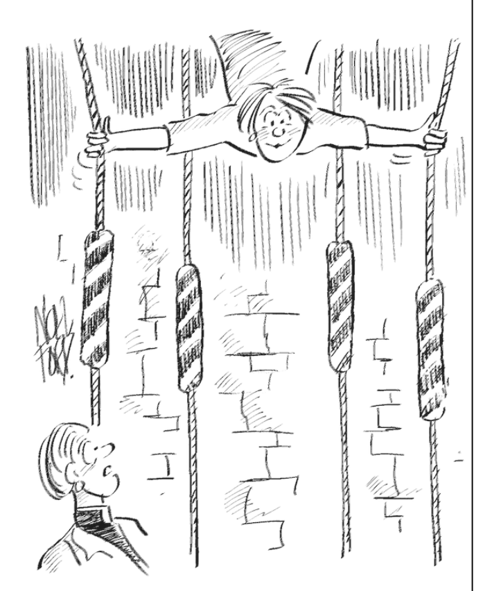
"Mrs Hargreaves, you've been watching too much of the Olympics gymnastics!"

The prayers are available alongside a free pdf download of liturgical resources